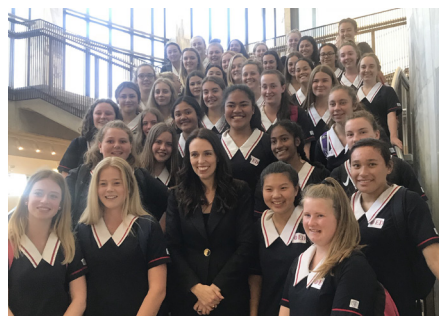
Students meet the Prime Minister

On 23 November, two Year 10 classes were all set for an exciting trip to parliament in Wellington eager to extend our knowledge on "Rule or to be Ruled" topic in Social Studies. The trip started off with a tour of the Wellington museum, where we learnt about the Wahine disaster and the history of Wellington. We then had the privilege to have a guided tour around the parliament building where everything we have been learning about in class came to life. As the tour was coming to an end, Jacinda Ardern appeared before our eyes. We had the honour to speak to her and have a photo with the Prime Minister herself. This was trip to remember and we feel so privileged to have been through this life changing experience.