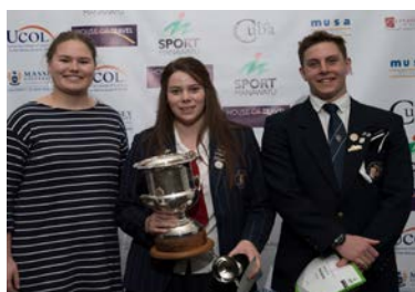
Senior A Squash Team - joint winners, Team of the Year